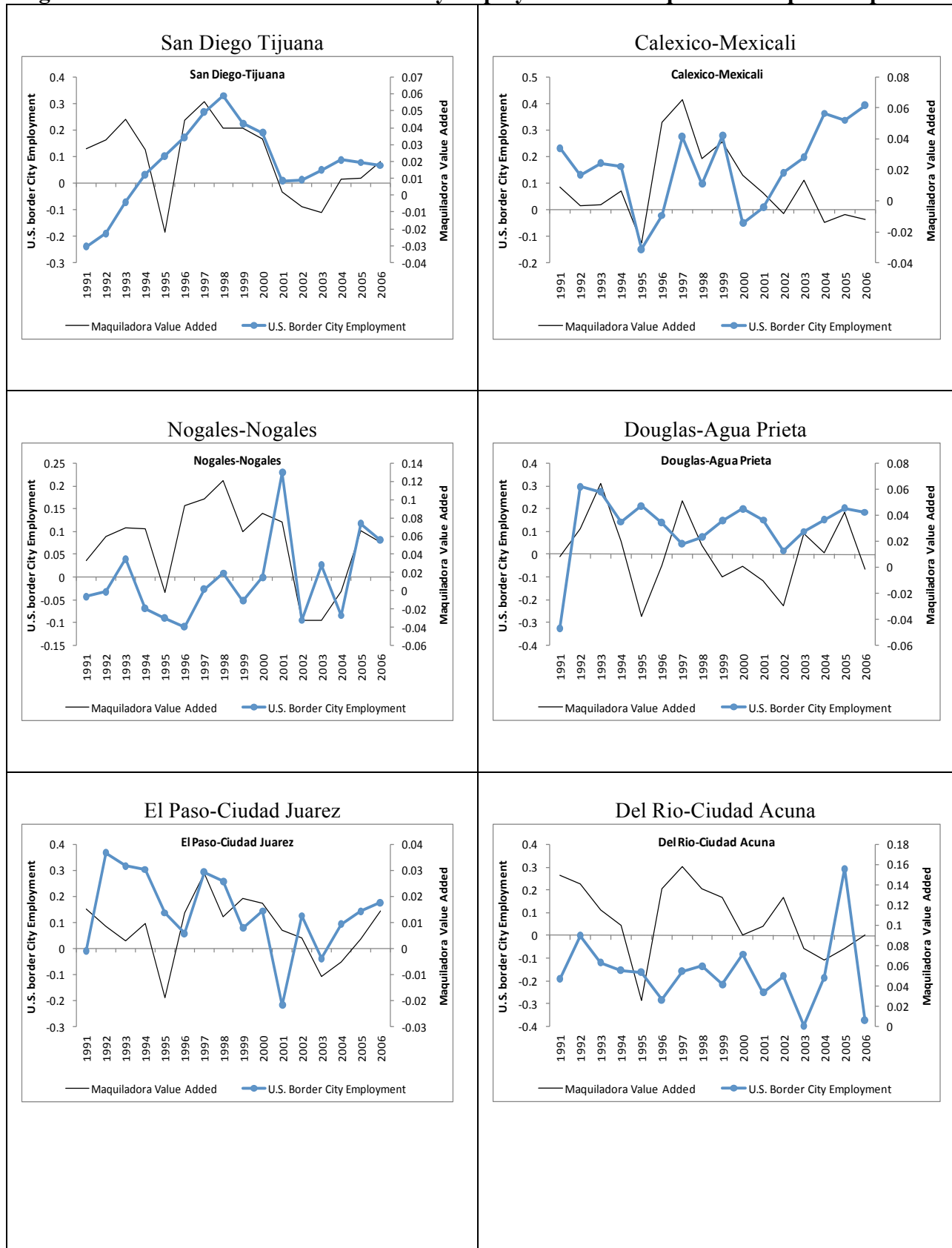
Figure 1. Growth rates in U.S. border city employment and maquiladora export output