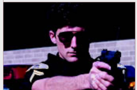
⑧ Police officer