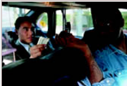
⑤ Taxi driver