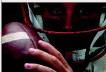
⑨ NFL football player