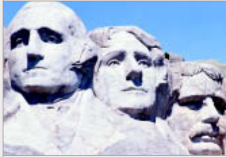
① U.S. president