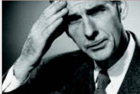
③ Senior corporate executive