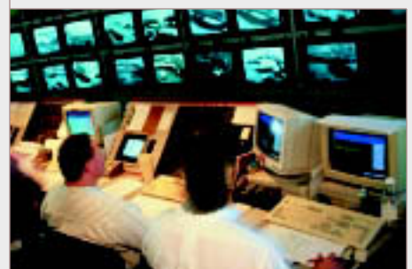
⑩ Air traffic controller