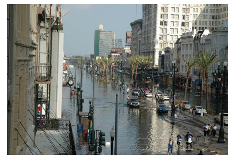
In 2005, Hurricane Katrina devastated New Orleans, exposing many of the city's structural deficiencies and the unmet needs of its residents.

In the wake of hurricanes Katrina and Rita, federal financial regulators saw an opportunity for banks to better serve the needs of their communities and assessment areas by becoming more involved in the revitalization and stabilization of communities devastated by natural disasters. The final guidance, which took effect in 2005, expanded the definition of "community development" under the CRA to include activities that revitalize or stabilize LMI geographies, distressed or underserved nonmetropolitan middle-income geographies, or designated disaster areas.