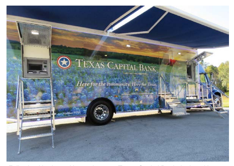
Following Hurricane Harvey in 2017, Texas Capital Bank deployed its mobile banking center to provide emergency banking services to its customers and the broader community.

Additionally, many banks have provided responsive retail services such as delayed credit bureau reporting; offered loan deferment of mortgage and auto payments; eased credit card qualification requirements, loan terms and credit limits; and provided small-dollar loans immediately following natural disasters. Some banks that have access to mobile banking facilities have even donated these mobile units to local nonprofits to provide banking services as well as emergency aid to LMI communities and individuals across impacted disaster areas.