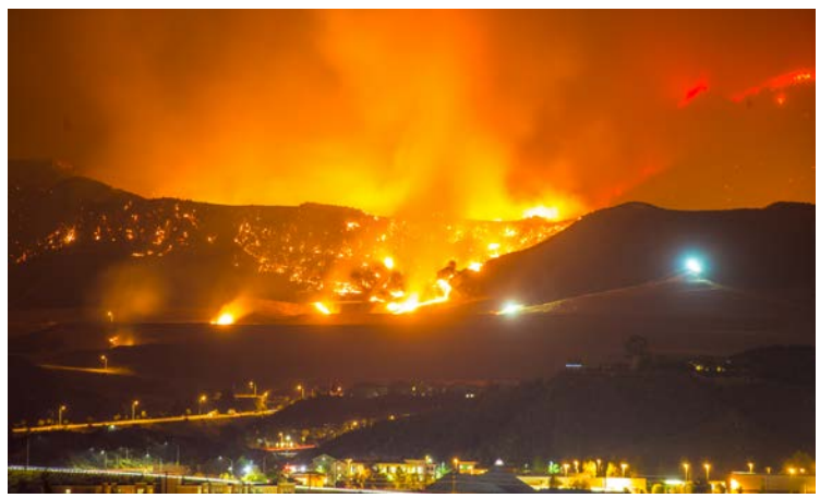
Wildfires in California, like this one near Santa Clarita in 2016, can have an economic impact that reaches beyond the geographic area.

In 2017 alone, natural disasters across the southern United States directly impacted Texas, Louisiana, Mississippi and Florida as well as the U.S. territories of Puerto Rico and the Virgin Islands. These disasters left in their wake billions of dollars in physical damage, stifling major industries and shutting down countless small businesses. In California, wildfires devastated nearly a dozen counties, compounding the effect of natural disasters on the U.S. economy.