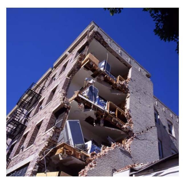
Earthquakes can cause irreparable damage to a city's critical structures; providing capital to safeguard buildings in vulnerable areas like Los Angeles can help ensure the vitality of a region's housing supply.

properties, and businesses by providing financing, financial counseling and other services. Additionally, banks supported small-business recovery efforts by investing in CDFIs, capitalizing new local, state and regional loan funds that provided flexible funding to targeted vulnerable populations, and utilizing NMTC allocations to replace needed public infrastructure. 10