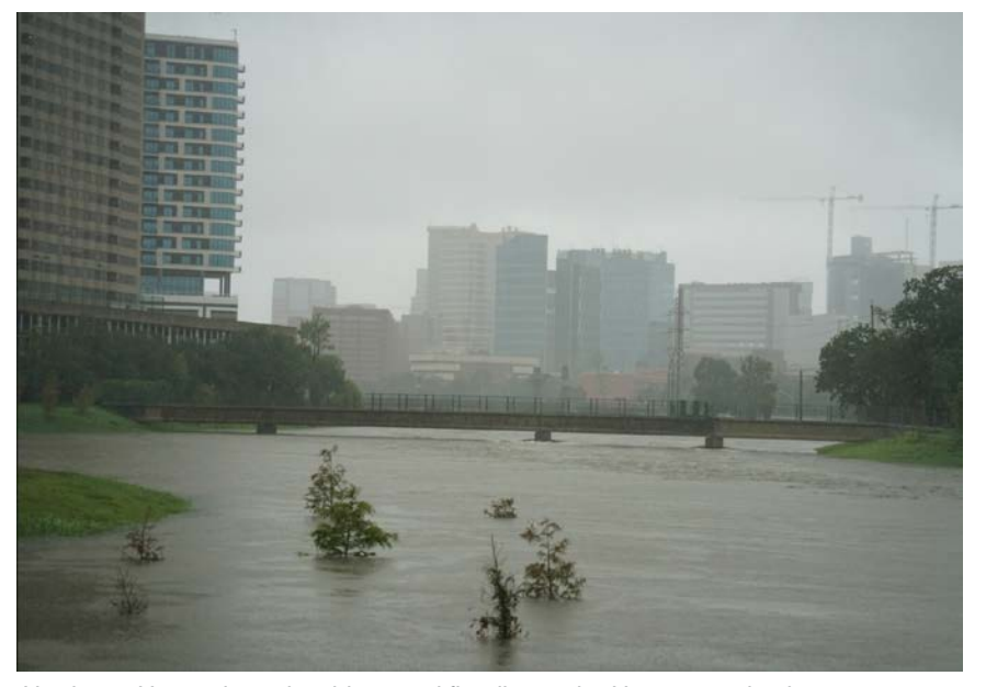
Hurricane Harvey brought widespread flooding to the Houston region in 2017, crippling the Texas Medical Center, one of the world's leading health care facilities.

Another example of this interdependence can be found in the Silicon Valley region of Northern California, which is vulnerable to earthquakes and wildfires. This region serves as an epicenter for many of the world's leading tech companies and has long stood as a major source of technological innovation within countless industries. Consequently, while the physical damage from a natural disaster striking this region might be geographically restricted, the potential economic impacts could have a far greater reach given the global importance of the region's technology sector.