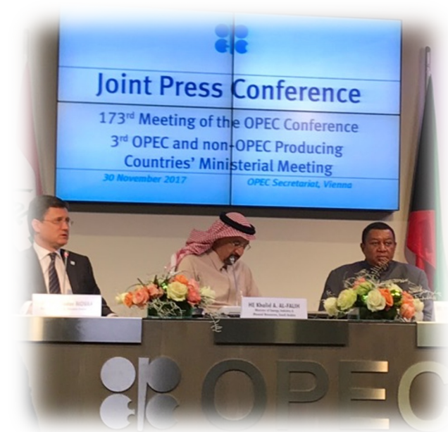
Former Russian oil minister Alexander Novak & former Saudi oil minister Khalid al Falih, 2017