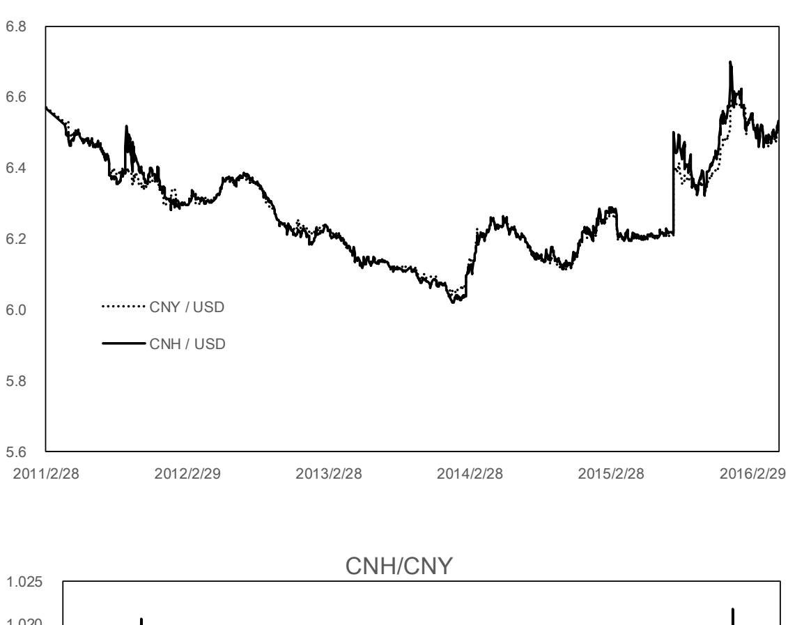
CNY and CNH