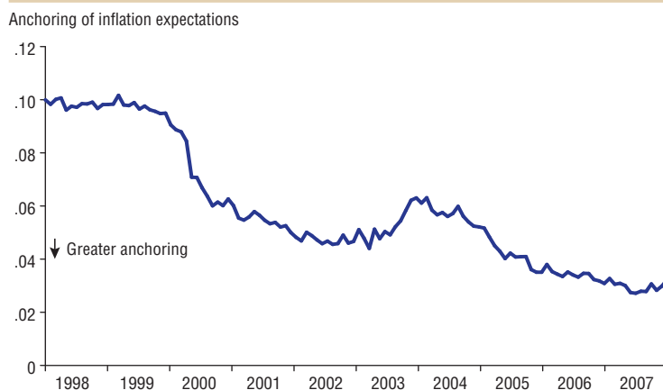
Chart 2 | Inflation Expectations Become More Anchored Over Time