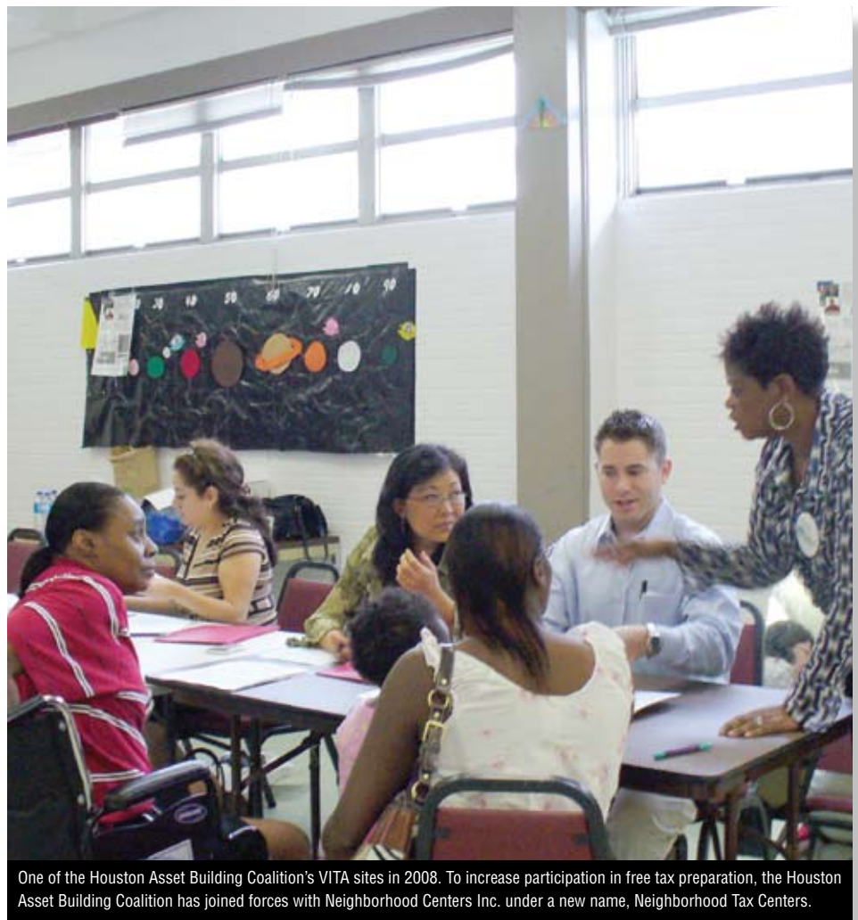
One of the Houston Asset Building Coalition's VITA sites in 2008. To increase participation in free tax preparation, the Houston Asset Building Coalition has joined forces with Neighborhood Centers Inc. under a new name, Neighborhood Tax Centers.

The 2008 TaxWise training was held in Dallas in September and in El Paso in October. Future training sessions will be held