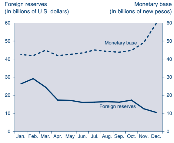
Figure 2 Mexico: Monetary Base And Foreign Reserves, 1994

Interestingly enough, until October 1994, Mexico had managed its monetary base according to a rule that far exceeded the rigor of the currency board standard. Before fourth-quarter 1994, Mexico's MB$FR ratio had been below 1 (that is, Mexico's foreign reserves had exceeded its monetary base). This observation suggests an alternative interpretation of Mexico's monetary policy. Perhaps what differentiated Mexico's experience from Argentina's is not that Argentina passed a law requiring a quasi-currency board