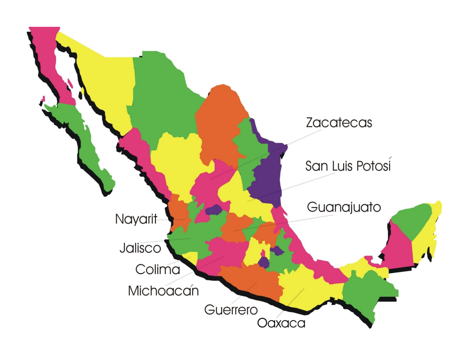
FIGURE 2: SURVEYED STATES